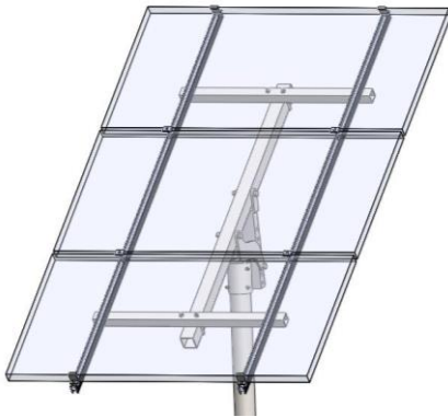
Standard PM3 with 3 x 200W panels